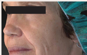
After 3 TX