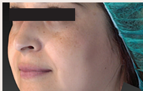
After 3 TX