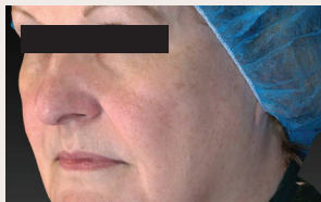
After 3 TX